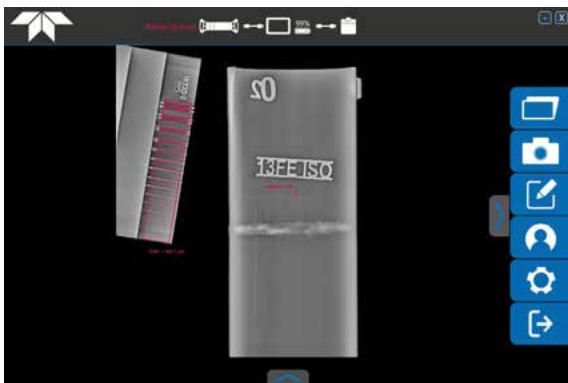
SRb / iSRb / automatic IQI recognition

The CP200B effortlessly interfaces with all our Go-Scan Series digital detectors, enabling inspectors to choose the most suitable detector for their specific application needs. Integrated with our Go-Scan detectors, our intuitive touch-screen software, Sherlock NDT , will help inspectors generate high quality images.