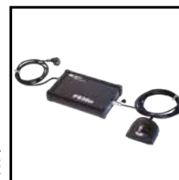
EXTERNAL POWER SUPPLY