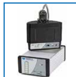
FAST BATTERY CHARGER